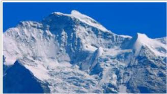
img01day.jpg 12.3 kB Thu 16 Jan 2014 04:26:35 PM IST

You need to construct a feature in a Digital Camera, which will auto-detect and suggest to the photographer whether the picture should be clicked in day or night mode, depending on whether the picture is being clicked in the daytime or at night. You only need to implement this feature for cases which are directly distinguishable to the eyes (and not fuzzy scenarios such as dawn, dusk, sunrise, sunset, overcast skies which might require more complex aperture adjustments on the camera).