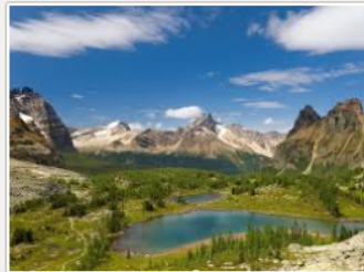
img02day.jpg 10.0 kB Thu 16 Jan 2014 04:27:08 PM IST