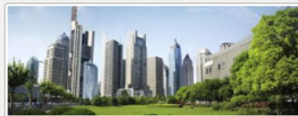
img04day.jpg 11.2 kB Thu 16 Jan 2014 04:28:06 PM IST