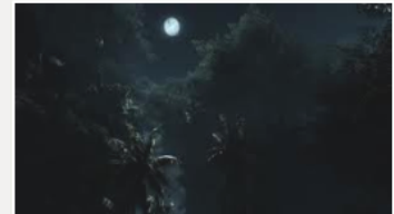
img10night.jpg 2.5 kB