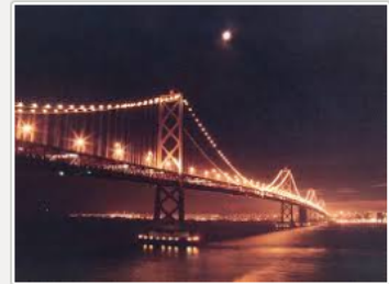
img12night.jpg 6.5 kB