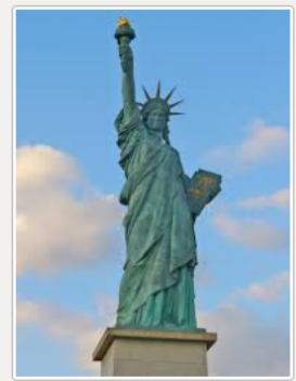
img08day.jpg 5.3 kB