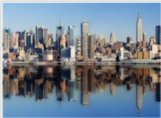
img03day.jpg 10.7 kB Thu 16 Jan 2014 04:27:56 PM IST