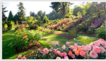
img07day.jpg 16.6 kB