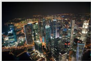
img11night.jpg 12.8 kB