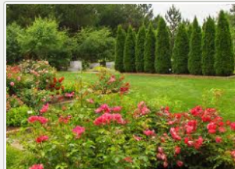
img06day.jpg 14.6 kB Thu 16 Jan 2014 04:29:44 PM IST