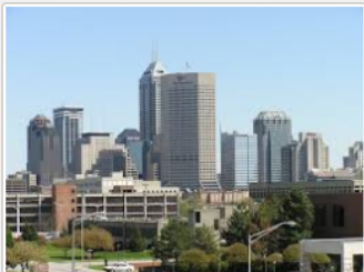
img05day.jpg 9.7 kB Thu 16 Jan 2014 04:28:18 PM IST